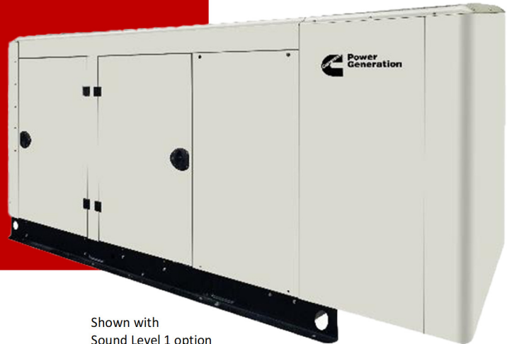
Shown with Sound Level 1 option